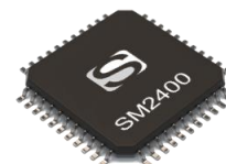
SM2400A-MQEQ-Y Modem Chip